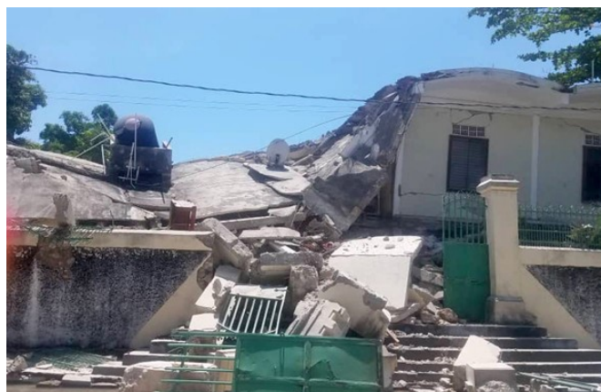
Caption: Earthquake destruction in Haiti.

Donate today at www.caritas.org.au or by calling 1800 024 413 toll free.