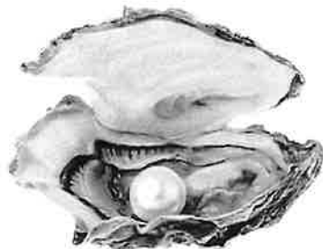
“The kingdom of heaven is like a merchant looking for fine pearls”