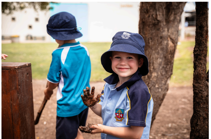
Photo: Water Play

Academic Award Ceremony Last day of School - 3.10pm Dismissal