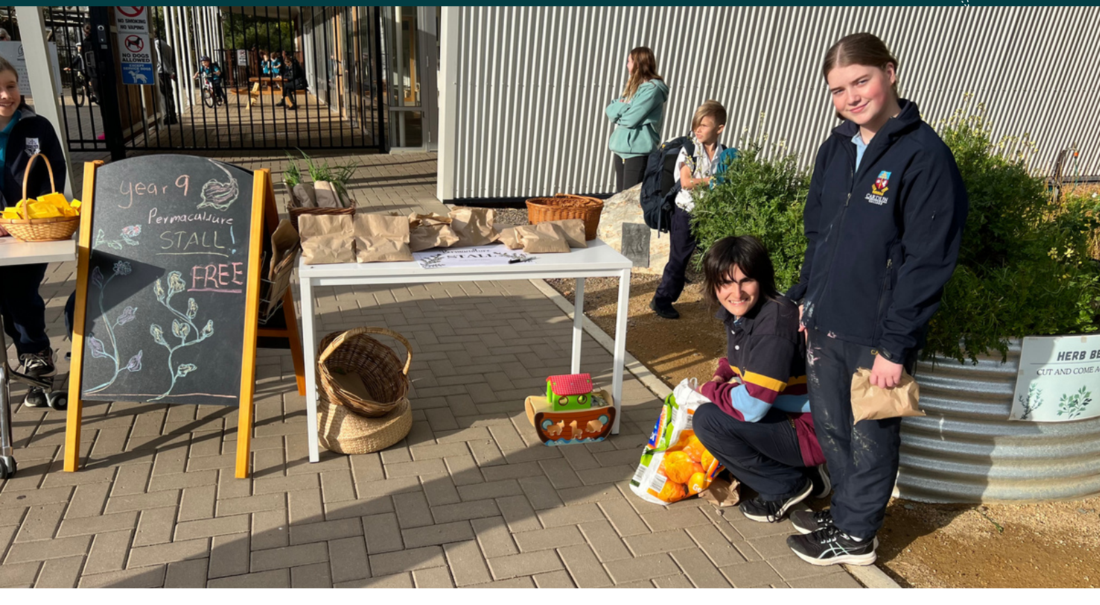
First Nations Education

During this term the Year 9 Passionate Permaculture students have been caring for Galilee's Community Garden beds. Our Indigenous garden bed has been growing one of the species of Salt bush. During Permaculture Principle 1 'Observe and Interact', students noticed the how big the salt bush was growing and decided to harvest and try propagating the plant. Many of the salt bush varieties can be used in various cooking ways including cutting up finely to be used to add a salty flavour to many dishes,